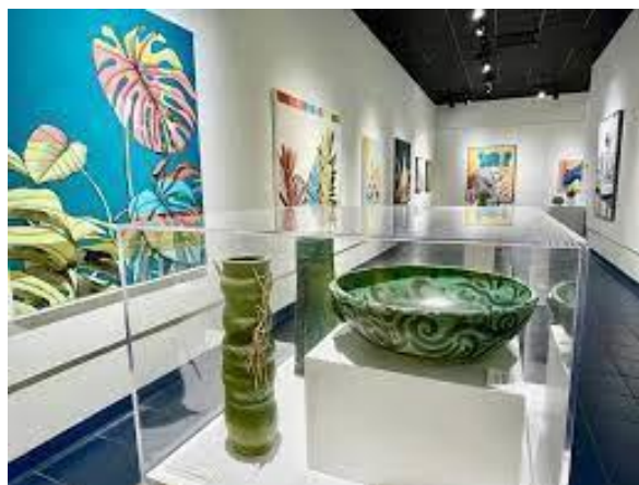
Mobile Pedestals Featuring Toni DeWitt Pottery

In 2023 and inside the terminal, JAX added three (3) acrylic covered, moveable, 57”h pedestals with an interior display size of 24”w x 24”d x 17”h each. These are dedicated to exhibiting sculptural works and will be located pre or post-security depending upon construction and space availability.