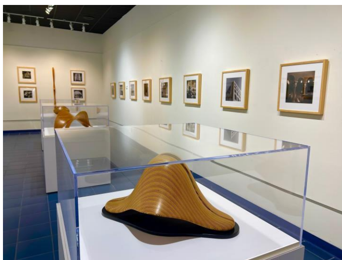
JAX Art Gallery Featuring Christopher W. Luhar-Trice Photography & David Engdahl Laminated Wood Sculptures

The JAX Art Gallery is located pre-security in the central courtyard. The gallery has high ceilings and can accommodate works up to eight feet tall. The gallery also includes four (4) acrylic covered, moveable pedestals with an interior display size of 32" w x 32" d x 15" h.