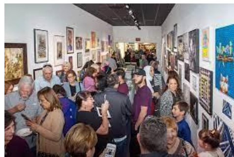
JAX Art Gallery Reception for Group Show

Eligibility: This opportunity is offered only to individual artists from the service region of JAX; in Northeast Florida including Alachua, Baker, Bradford, Clay, Duval, Flagler, Nassau, Putnam, St. Johns, and Union counties and in Southeast Georgia including Brantley, Camden, Charlton, Clinch, Glynn, and Ware counties. Artists who have previously exhibited at JAX may re-apply if a new series is submitted. Preference will be given to artists who have not displayed their artwork at JAX within the previous three years.