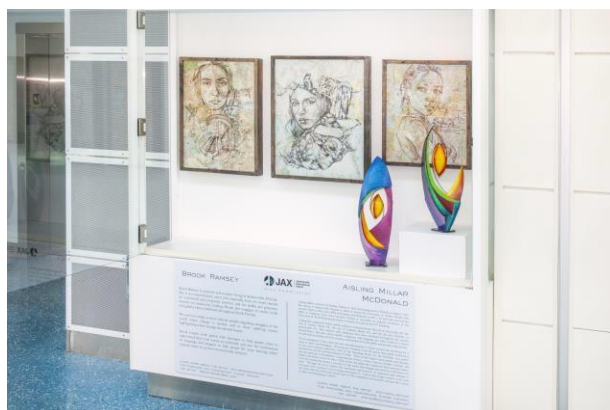
Concourse C Case Featuring Brooke Ramsey Paintings & Aisling Millar McDonald Painted Public Art Sculpture Maquettes

These display cases are located post-security, at the end of Concourses A and C. There are four (4) cases total, all measuring 50" h x 14" d. The two cases in Concourse A each measure 80" w and 90" w. The two cases in Concourse C each measure 60" w and 85" w.