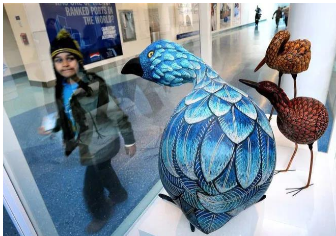
Connector Bridge Installation Featuring Gourd Sculptures by Mindy Hawkins

100% of the funds earned from the sale of art are provided to the artist in order to fully support the creative economy in the JAX service area.