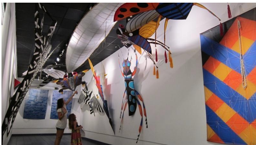
JAX Art Gallery - JAX Kites & Flights Exhibit by Artists Walker and Peters