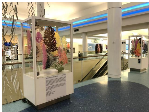
Connector Bridge Installation Featuring Papercuts by Sheila Goloborotko

This area also includes two (2) acrylic covered, moveable pedestals with an interior display size of 32" w x 32" d x 15" h.