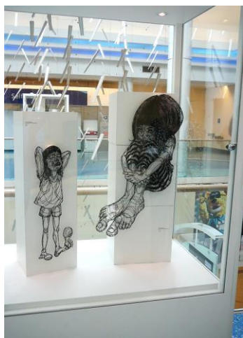
Connector Bridge Exhibit Featuring Hiromi Moneyhun Papercuts

Visit our website at JAXAirportArts.com to learn more about the JAA Arts & Culture Program at JAX. Select the Exhibitions Opportunity tab to access the Call to Artist form.