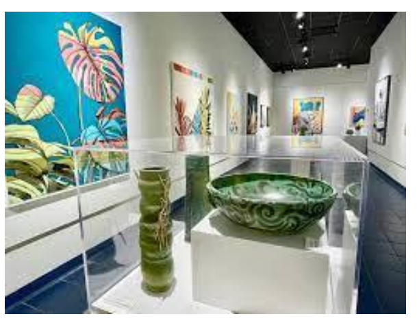
Mobile Pedestals Featuring Toni DeWitt Pottery

In 2023 and inside the terminal, JAX added three (3) acrylic covered, moveable, 57"h pedestals with an interior display size of 24"w x 24"d x 17"h each. These are dedicated to exhibiting sculptural works and will be located pre or post-security depending upon construction and space availability.