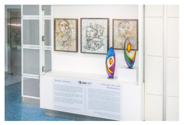
Concourse C Case Featuring Brooke Ramsey Paintings & Aisling Millar McDonald Painted Public Art Sculpture Maquettes

These display cases are located post-security, at the end of Concourses A and C. There are four (4) cases total, all measuring 50"h x 14"d. The two cases in Concourse A each measure 80"w and 90"w. The two cases in Concourse C each measure 60"w and 85"w.