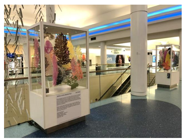
Connector Bridge Installation Featuring Papercuts by Sheila Goloborotko

This area also includes two (2) acrylic covered, moveable pedestals with an interior display size of 32"w x 32"d x 15"h.