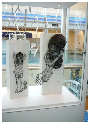
Connector Bridge Exhibit Featuring Hiromi Moneyhun Papercuts

Visit our website at <u>JAXAirportArts.com</u> to learn more about the JAA Arts & Culture Program at JAX. Select the Exhibitions Opportunity tab to access the Call to Artist form.