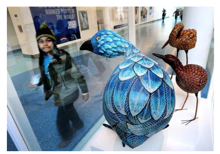
Connector Bridge Installation Featuring Gourd Sculptures by Mindy Hawkins

100% of the funds earned from the sale of art are provided to the artist in order to fully support the creative economy in the JAX service area.