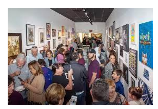
Haskell Gallery Reception for Group Show "W.A.V.E."

Exhibition Period: Art exhibitions generally rotate quarterly with an average exhibition period of three months and may be scheduled up to one month to one year in advance.