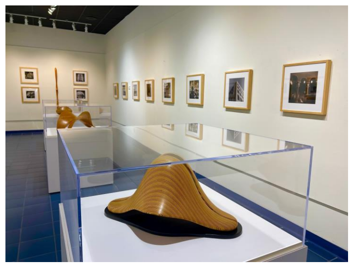
Haskell Gallery Featuring Christopher W. Luhar-Trice Photography & David Engdahl Laminated Wood Sculptures

The Haskell Gallery is located presecurity in the central courtyard. The gallery has high ceilings and can accommodate works up to eight feet tall. The gallery also includes four (4) acrylic covered, moveable pedestals with an interior display size of 32"w x 32"d x 15"h.