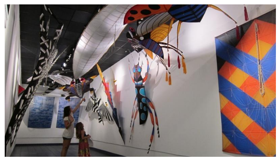
Haskell Gallery JAX Kites & Flights Exhibit by Artists Walker and Peters